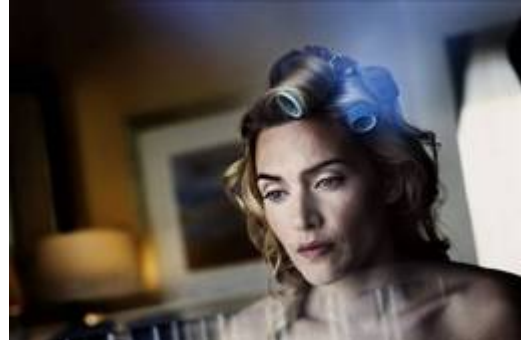
winner Arts & Entertainment

The World Photography event opens at 18Gallery, inside the renowned Bund 18 in Shanghai on Tuesday 28 September with the 2010 Sony World Photography Awards exhibitions. The first edition of the annual World Photography Festival, Shanghai will take place within Bund 18 from 14 – 16 October. This is the first of four new annual international festivals created by the World Photography Organisation.